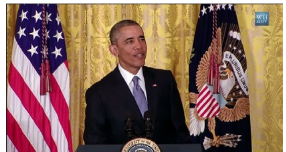
President Obama speaks at the WHCOA

This event marked a momentous occasion- it was the first time a US president has ever acknowledged Elder Abuse as a growing epidemic! Watch President Obama's remarks here. You can also review WHCOA exciting outcomes on this Fact Sheet released by the White House.